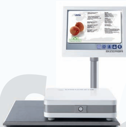
Information terminal for consumer advice