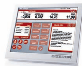
K-class 12" sales assistant touchscreen