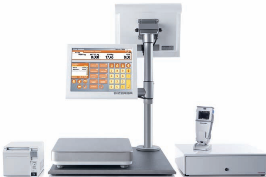
Checkout and scale combinations with screens for operator and consumer