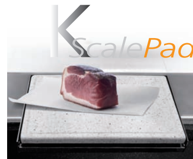
KScalePad – ultra flat scale for integration in the sales counter