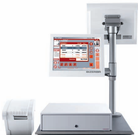
POS terminal with multimedia advertising option and connection to scale network