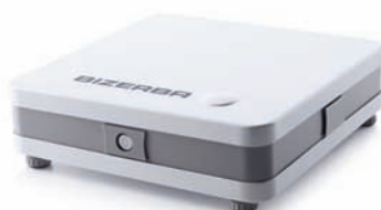
K-class flex CPU/control unit