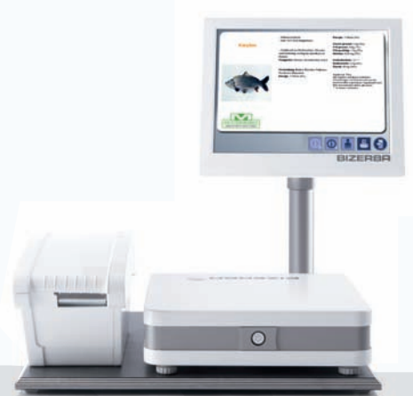
Information terminal with printer option