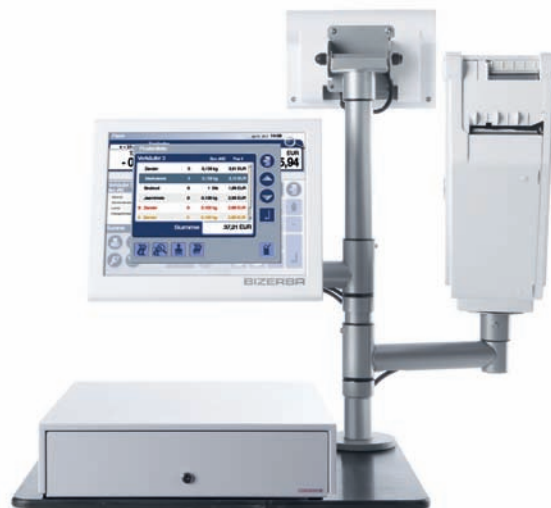
Price labelling and POS terminal with multimedia advertising