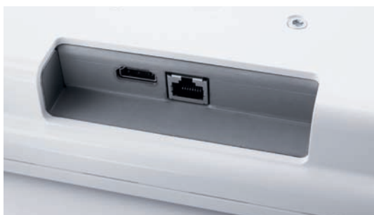
Connections 12" or 7" customer screen