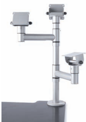
K-class flex carrier system

Thanks to a fully modular design, the Bizerba K-class flex offers applications that were previously not available. Stand-alone or totally new counter concepts within a scale network. In an identical attractive design and centrally controlled from the back office using the Bizerba .RetailFramework just like the entire K-class series.