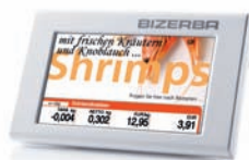
K-class 7" customer screen