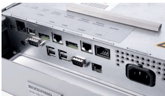
Connections CPU including power supply for all connected components