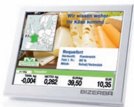
K-class 12" customer screen