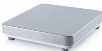
K-class flex scale type LA KF