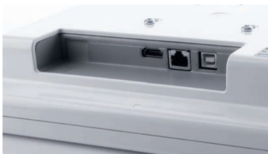
Connections 12" sales assistant touchscreen with integrated WLAN (option)