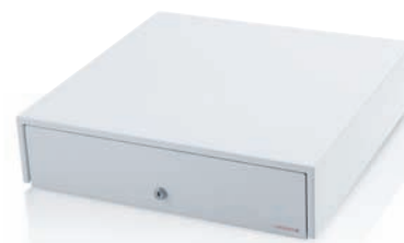
K-class cash register