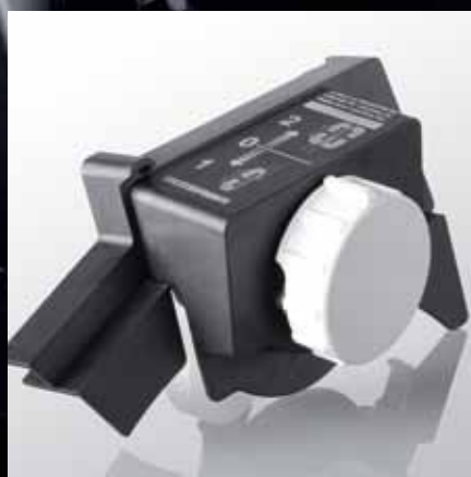
Removable sharpener: easy to operate by placing in a precise sharpening and removal position. Fully protected against unintentional contact.