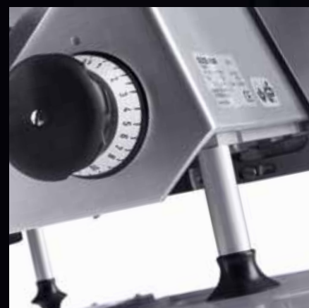
Raised feet for better cleaning of the counter surface under the machine.