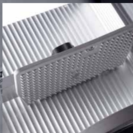
Sliding grooves in carriage plate, gauge plate and blade cover: these are all conditions for ergonomic operation that is gentle on the product.

The motors of the Bizerba GSP V are extremely quiet and run with a much lower power requirement: compared with other machines on the market, the GSP V has 35% less power consumption. In standby mode it even has zero power consumption. This is good for the environment and even better to save running costs. Day in, day out, year in, year out, and all round the clock.